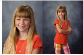
Pose A Pose B

Please make checks payable to B&C Studios